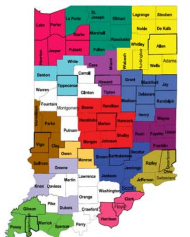
Map of 2-1-1 Coverage